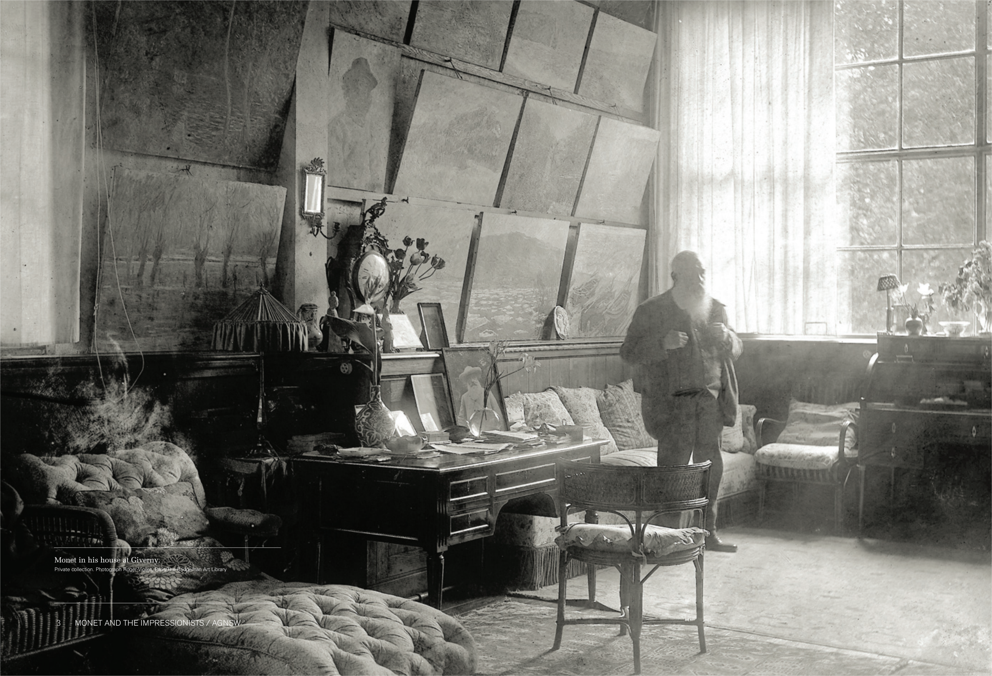
Monet in his house at Giverny.

Private collection.